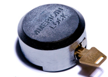
American Lock Included